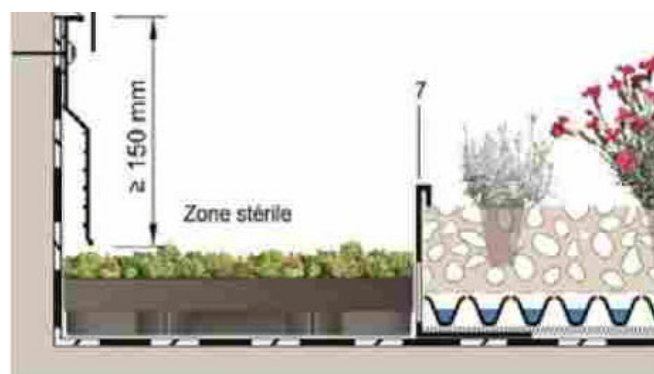
Clean Stone Zone